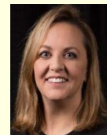
Forbus 15 PepsiCo

Trustees meet quarterly for governance, oversight, funding and administration (ie long term sustainability of the body)