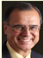
Liodice 11 ANA