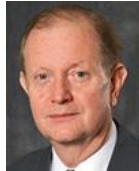
Calder 16 NW Kellogg