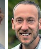
Bezzo 17 SC Johnson