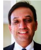
Garga 14 [m]PHASIZE