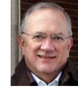
Gregory Tenet Partners (Emeritus)