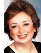
Ebben 12 Global Marketing Impact