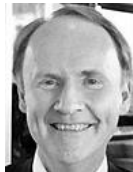
Sandvik 18 U SE Norway