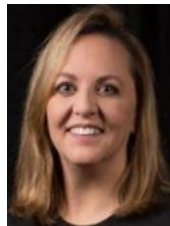
Forbus 15 The Walt Disney Studios SVP