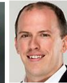
Hamilton 19 DoubleCheck