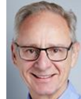
Montgomery Group M