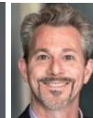
Greenfield 18 C3 Metrics