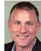
Wokosin U of Iowa-Tippie