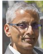
Papatla 16 UW-Milwaukee