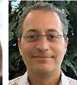
Klein 16 MSW