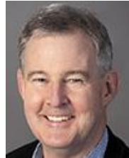
Knowles Type 2 Consulting