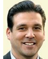
Bamundo Laurel Road