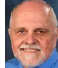
Sexton 18 Columbia (Emer) (Secretary)