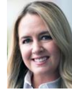
Johnson 14 ESPN