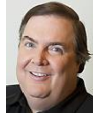
Pace 17 MASB President/CEO