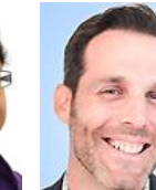
Fisher 20 Sponsorium