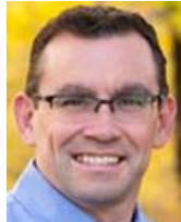
McDonough LL Bean