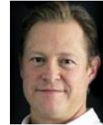
Newell Brand Finance