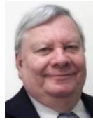
Kuse 08 MMAP Center