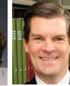
Gruca 17 U of Iowa