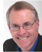
Gugel 09 Gugelplex TV