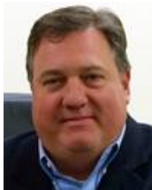
Ivie 13 Media Rating Council CEO