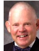
Plummer 06 Sunstar Foundation (Emeritus)