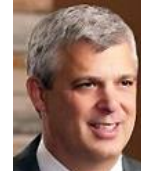
Banks 14 At Large