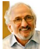
Wind 10 Wharton