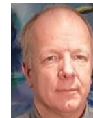
vd Watering 18 Accountable Marketing