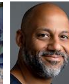
Cantu 18 Cantu Holdings