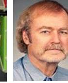
Gaski 17 U Notre Dame