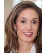
Rosen 16 4A's