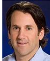
Donnelly Fox Sports