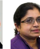
Menon 19 Kantar