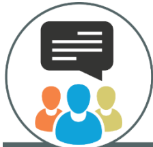
Voice of the Customer