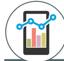
Director of the Digital Roadmap