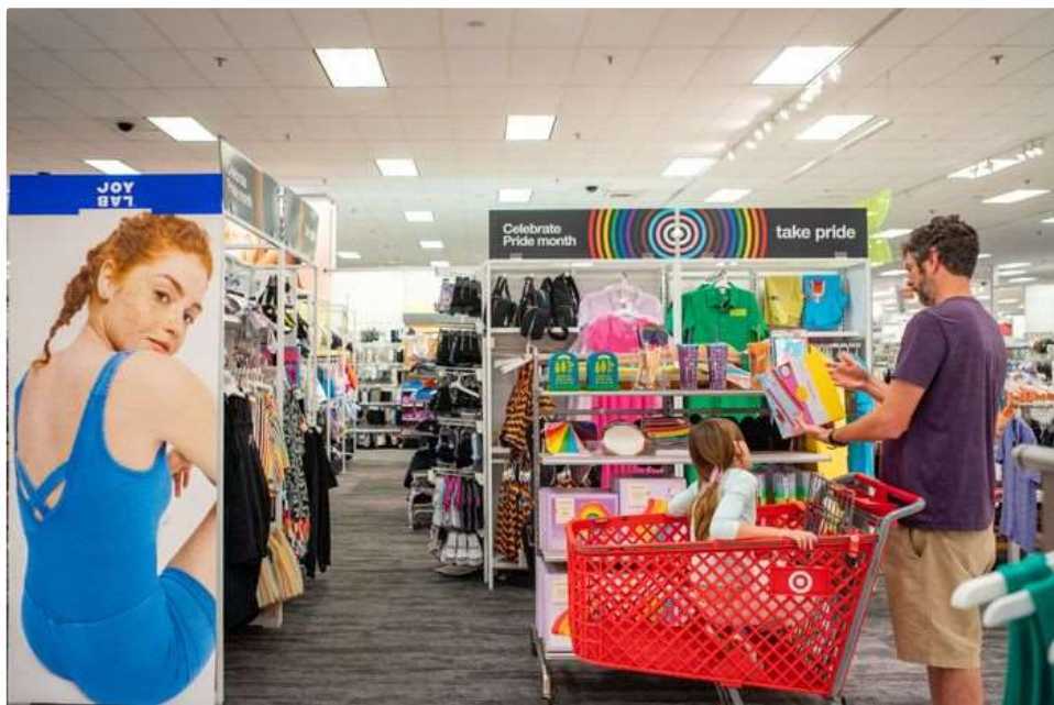
Target was one of the retailers to face criticism and calls for a boycott after displaying Pride Month merchandise.